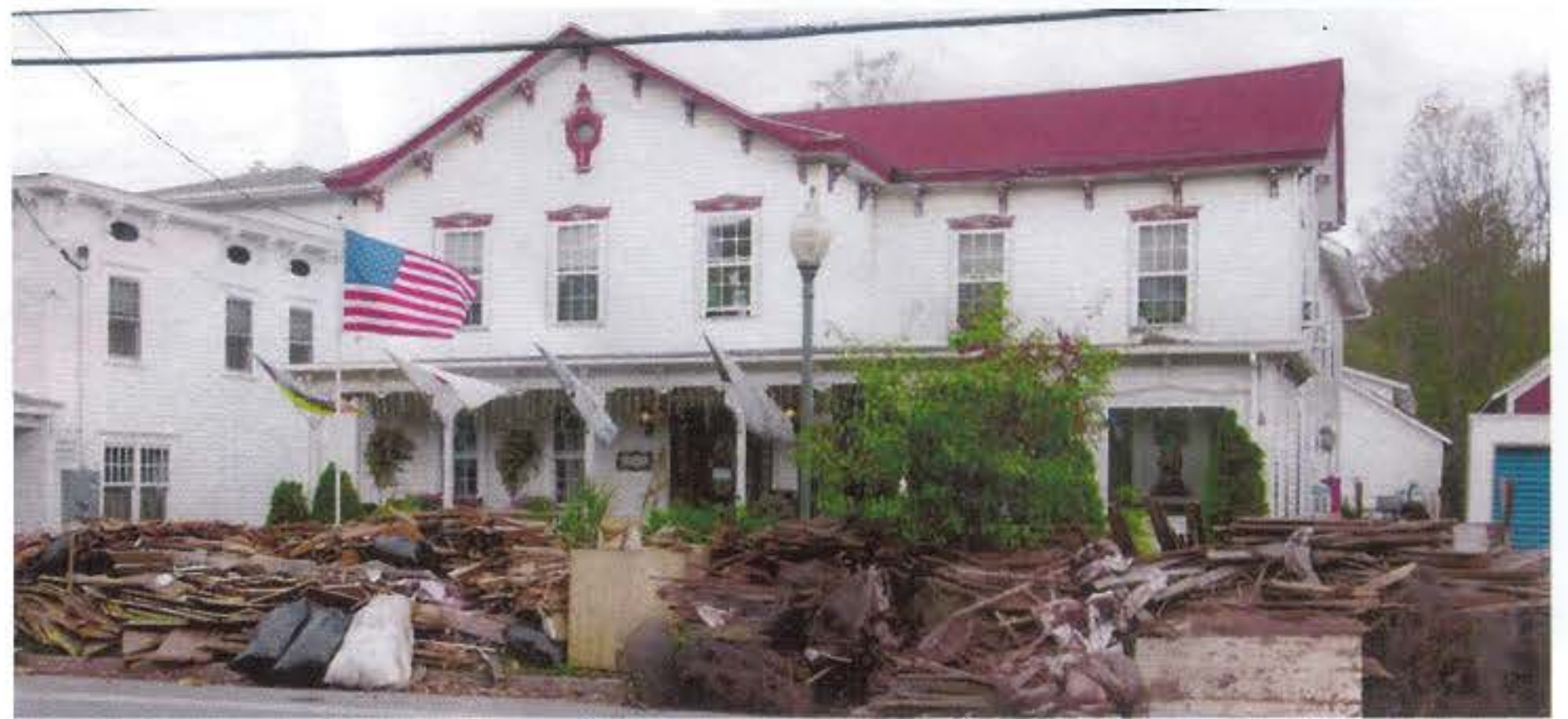
right: "Beds on Clouds" during reconstruction. See article for the recovery photograph.