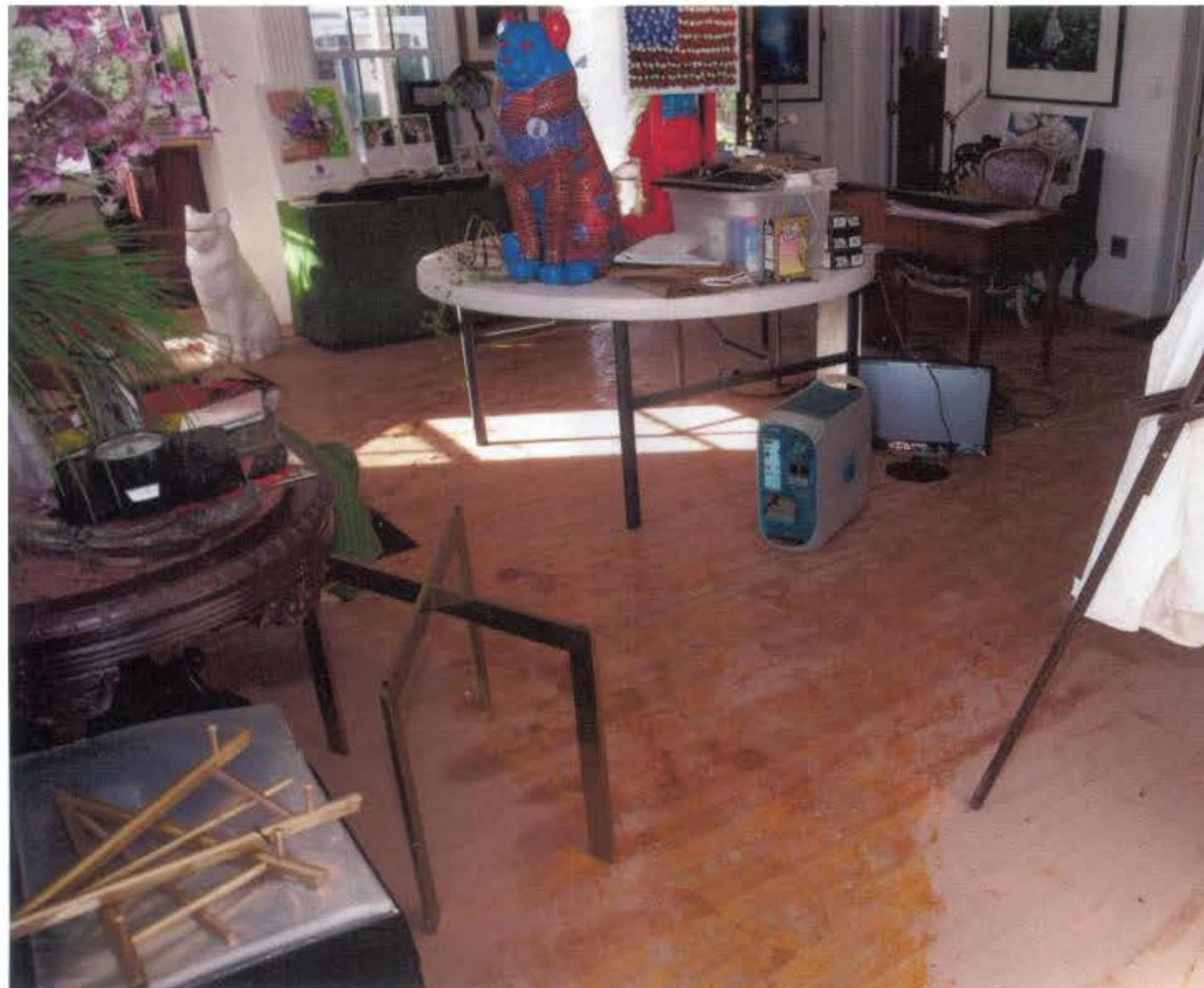
left: The Gallery was flooded, bringing with it much mud. See article for the recovery.